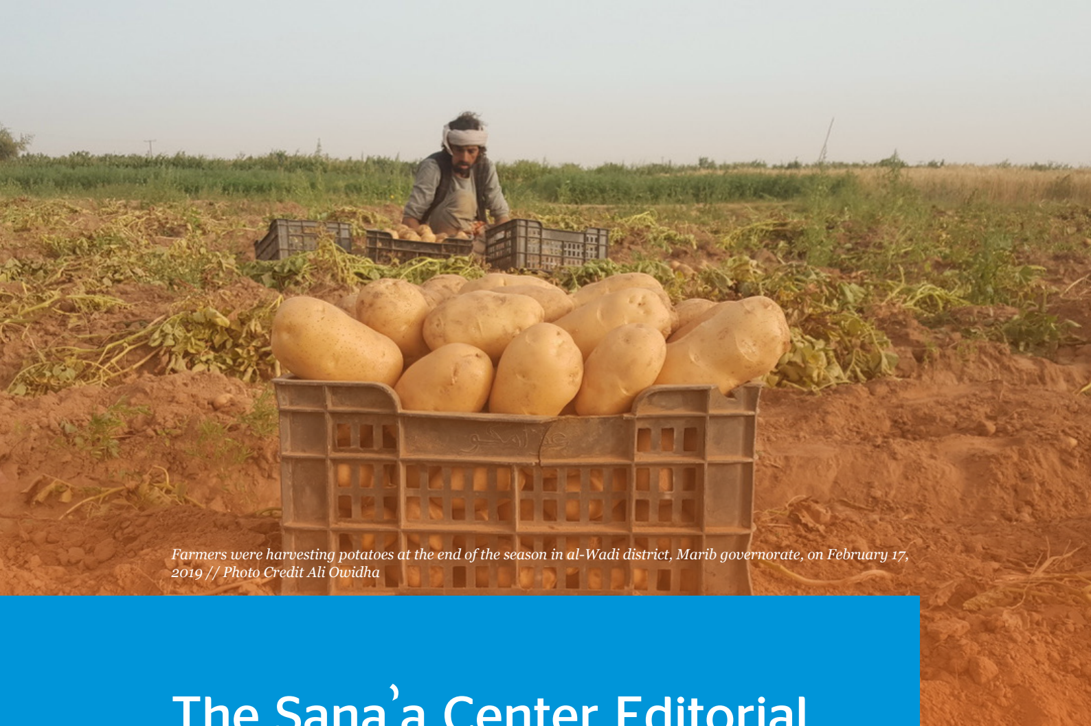
Farmers were harvesting potatoes at the end of the season in al-Wadi district, Marib governorate, on February 17, 2019