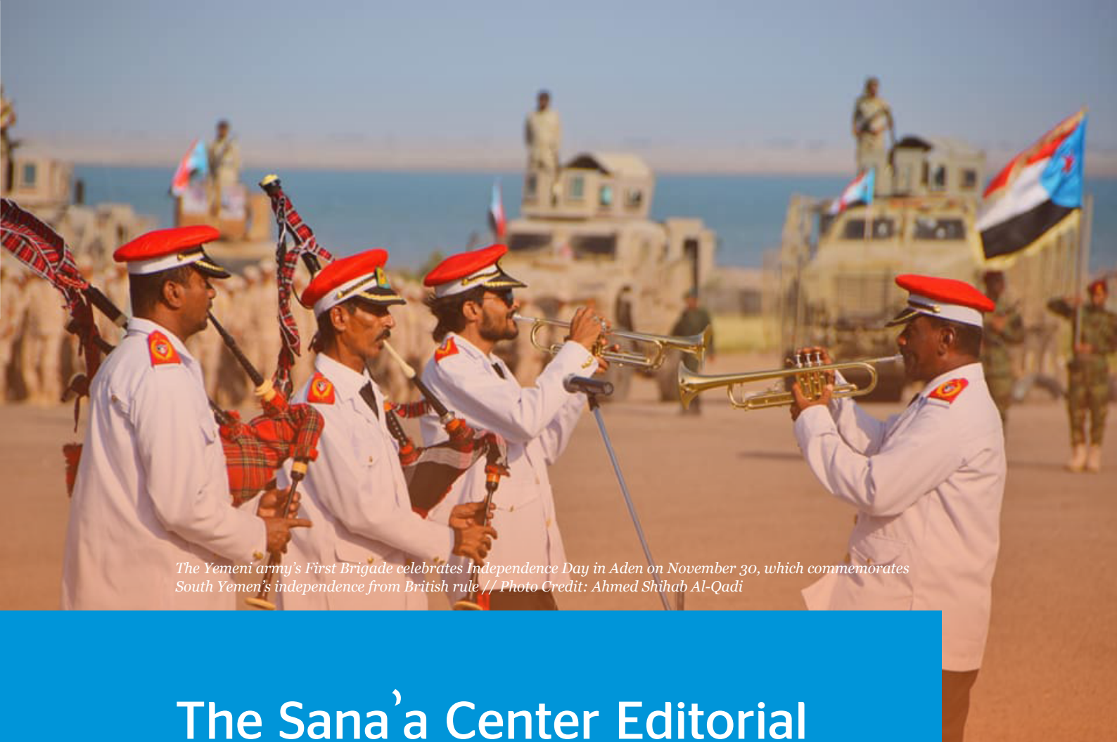
The Yemeni army's First Brigade celebrates Independence Day in Aden on November 30, which commemorates South Yemen's independence from British rule