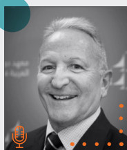
STEPHEN A. SECHE

Former Yemeni diplomat and former Deputy Minister of Foreign Affairs.