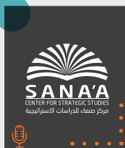
SANA'A CENTER FOR STRATEGIC STUDIES