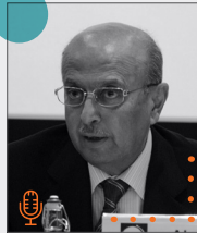
ABU BAKR AL-QIRBI

Former Minister of Foreign Affairs (2001-2014).