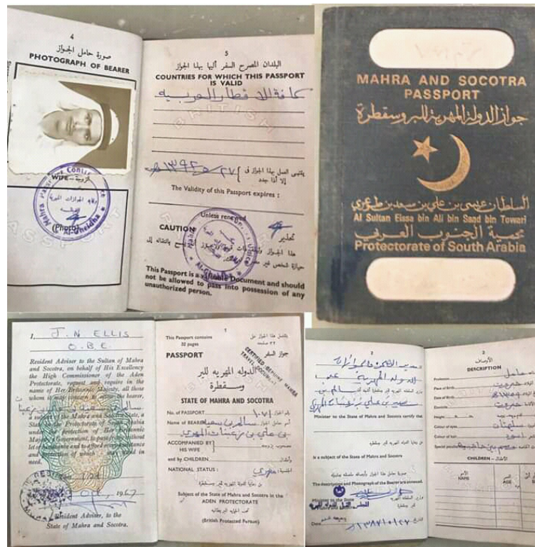
Fort Afrar in the town of Qishn, which was the former residence of the Sultan of al-Mahra and Socotra. Pictured here on February 10, 2019.

Given that the current Saudi military deployment in al-Mahra has given the Saudis de facto military control over large stretches of the governorate, many locals now believe Riyadh is exploiting the current situation to revive its aspirations for the construction of the oil pipeline. (12) Mahris generally oppose the project as an infringement on their sovereignty while Oman views the Saudi maneuvering as an encroachment on its sphere of influence. (13)