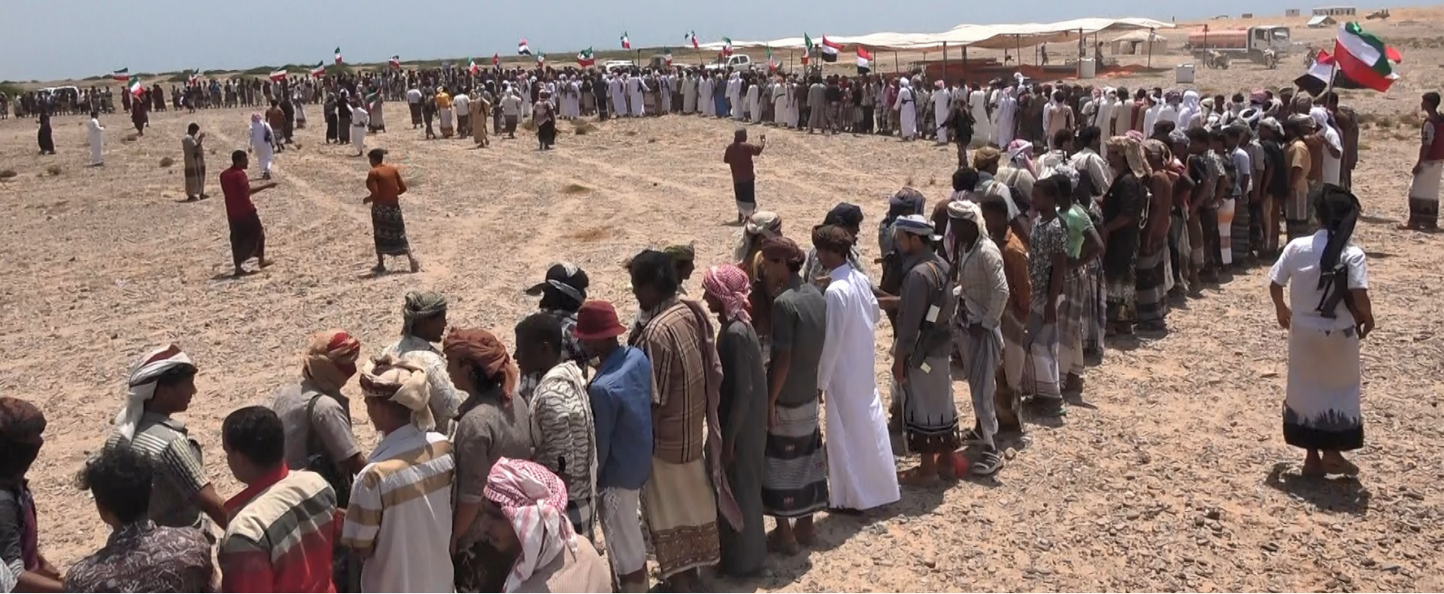
Mehris in the Tammoun area of Masilah district organized a protest festival to reject the Saudi military establishing a military base in their area, September 17, 2018