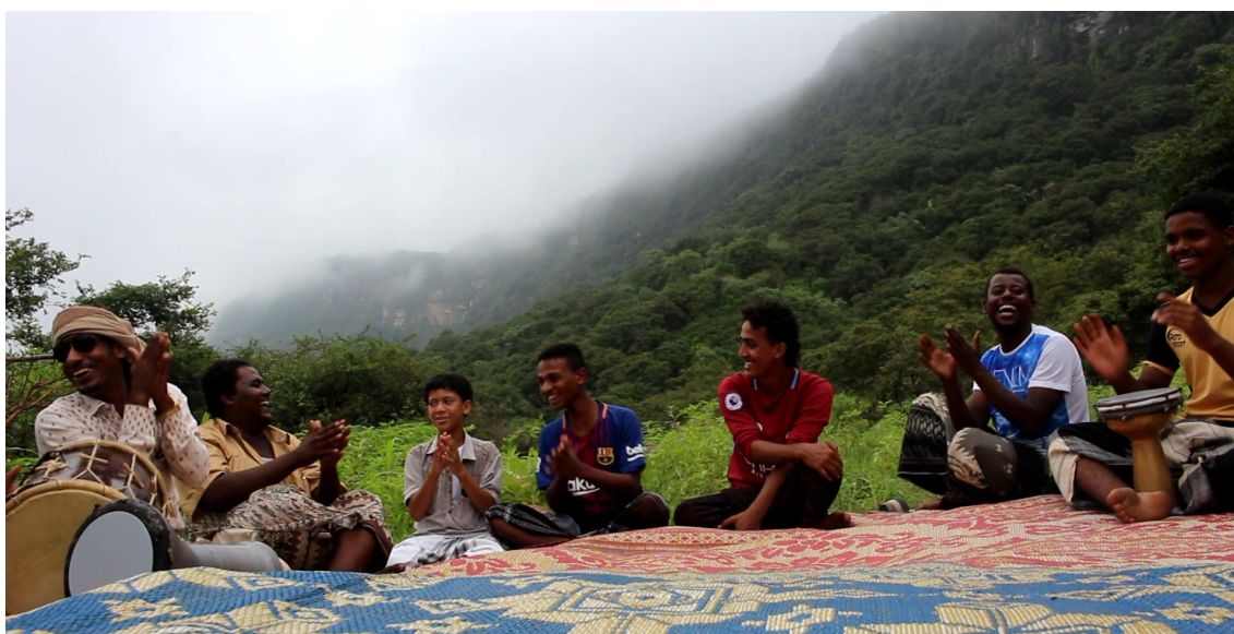
Local tourists in the Hawf Nature Reserve, July 27, 2018