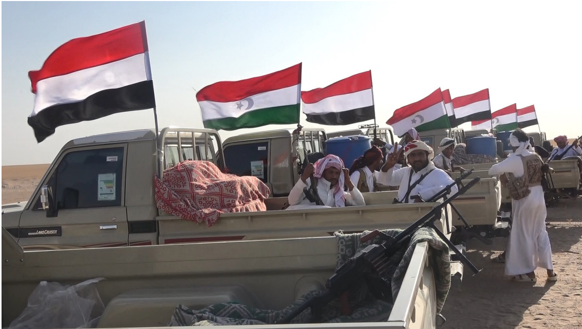
Mehri tribesmen, flying both the flags of Yemen and al-Mahra, prepare for a protest in the Touf area of Hat district against the Saudi military presence in al-Mahra, September 24, 2018.