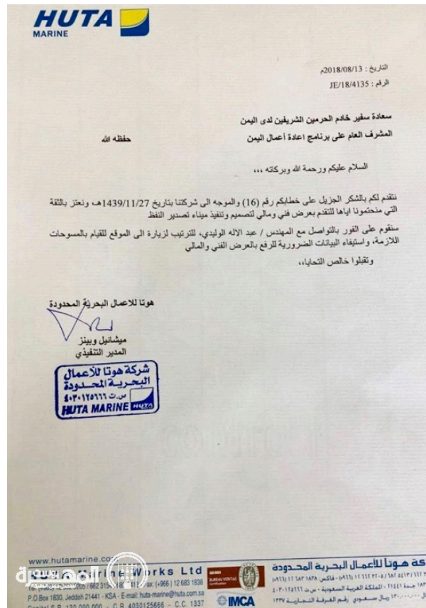
A letter published by the Mahra Post, which would appear to show the Huta Marine Works company thanking the Saudi ambassador to Yemen for asking for a proposal for a feasibility study to build an oil port, dated August 13, 2018.

desire to build an oil pipeline through the governorate. A memo had been leaked in the previous month in which the Saudi company Huta Marine Works, part of the Bin Laden Group, thanked the Saudi Ambassador to Yemen and Chairman of the Yemen Reconstruction Program for his confidence in commissioning the company to submit a feasibility study to build an oil port. Although the memo did not explicitly mention al-Mahra, it was used as evidence of Saudi intentions by local and regional media. (83)