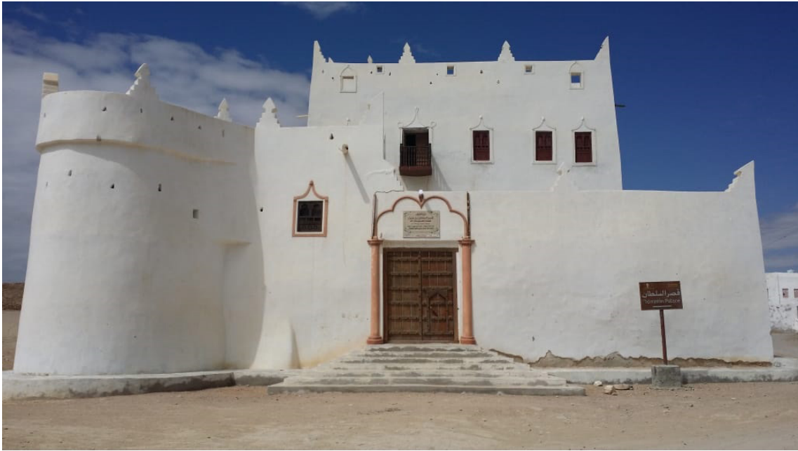
Fort Afrar in the town of Qishn, which was the former residence of the Sultan of al-Mahra and Socotra. Pictured here on February 10, 2019.

guerillas at the United Nations General Assembly in Geneva, Britain pulled all personnel out of the governorate in 1967, leaving al-Mahra to be overrun. Many Mahris were killed in violence that followed the British exit. (6)