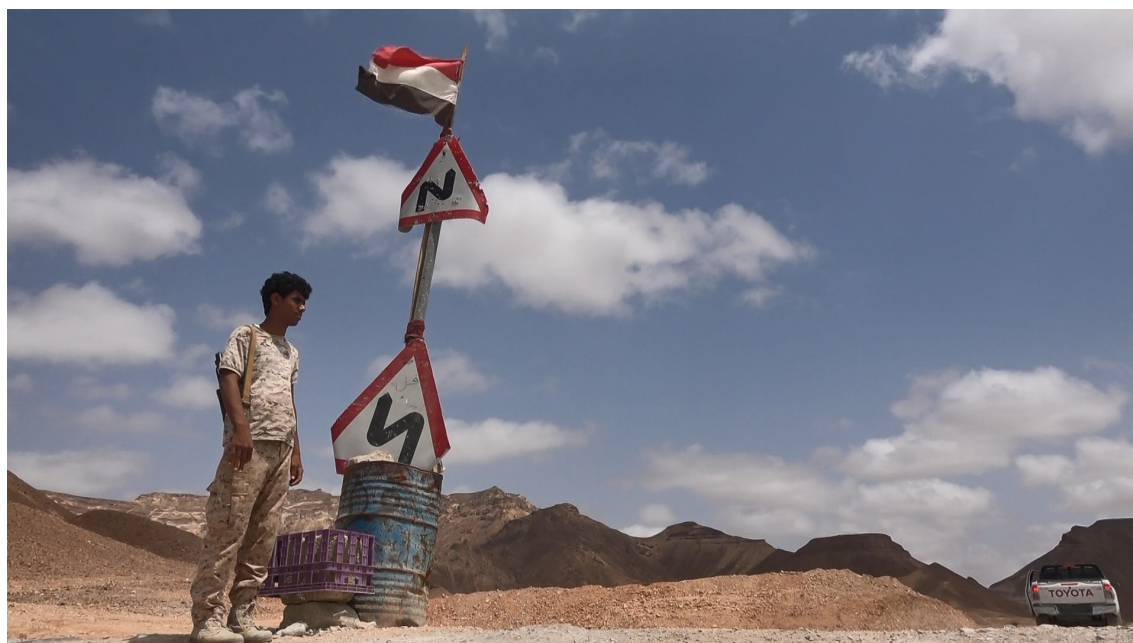
A soldier with the local authorities in al-Mahra mans the Tanhalen checkpoint on the main road in al-Ghaydah district, September 15, 2018

At the beginning of 2017, Bin Kuddah told UAE officials that Mahri forces would only take orders from the local authority. (29) In this demand, Bin Kuddah was backed by Oman, the local authority, and the General Council of the People of al-Mahra and Socotra, a body of tribal leaders formed in 2012 and headed by Sultan Abdullah al-Afrar. (30) The Emiratis, viewing the opposition as a betrayal, fully withdrew from the governorate. UAE officials also took back the vehicles they had provided to the governor, saying they were going to be refurbished, however to-date the vehicles have not been returned. (31)