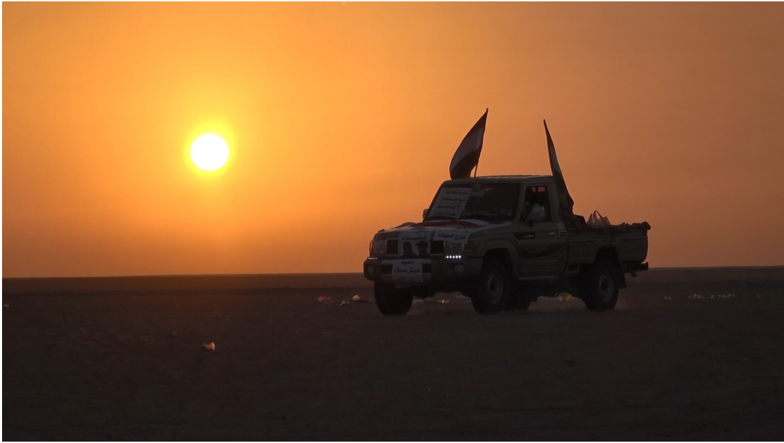
A truck at dawn preparations for a protest against the Saudi military presence in the Touf area of Hat district in al-Mahra, September 24, 2018.

To determine al-Mahra's collective position regarding the Saudi troops, a meeting was held between representatives of the local authority, the governorate's security committee, the General Council and the tribes. On November 15, the gathering articulated six conditions to permit the deployment of Saudi forces, chief among them that the airport not be turned into a military base and the need for coordination between Saudi forces and the local authority. (42) After acceding to the demands, the Saudi forces were permitted to assume control of the airport.