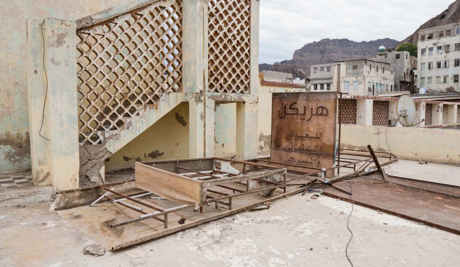
An old rusted sign of the Hurricane Cinema on top of the building in Aden, May 4, 2021