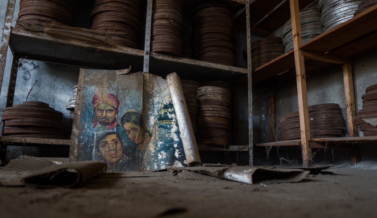
An old poster of an Indian blockbuster film is propped against old rolls shelves in Hurricane Cinema in Aden, May 4, 2021