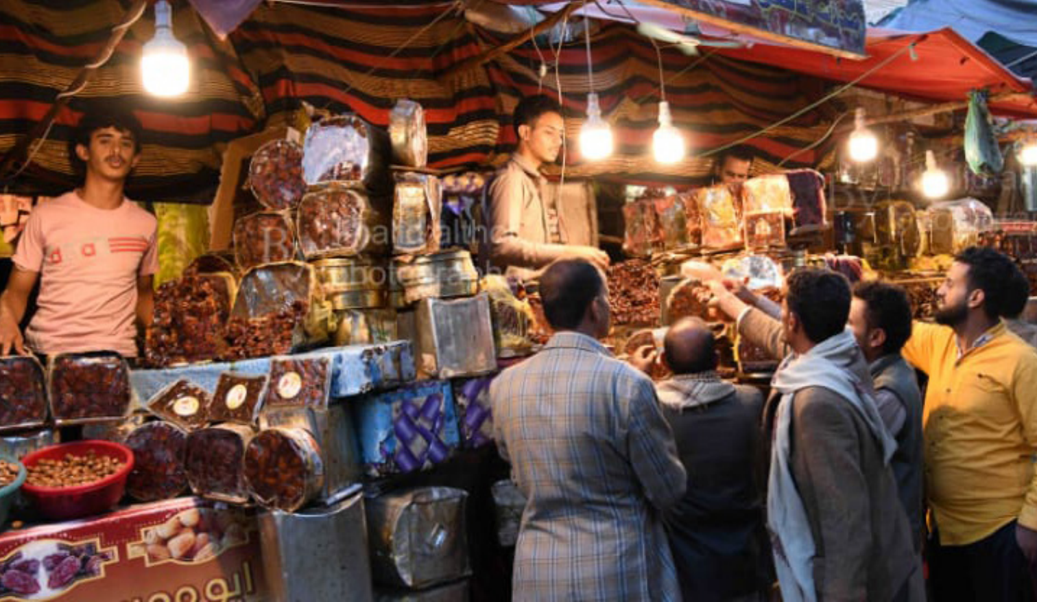
The souk in the Old City of Sana'a, May 7, 2019

which had broke away from the Abbasid Caliphate, emerged triumphant from a series of battles with Ziyadid forces in 819 AD. With Sana'a as its capital, its jurisdiction extended across Yemen to Hadramawt, with its rule lasting until roughly 1000 AD. [10]