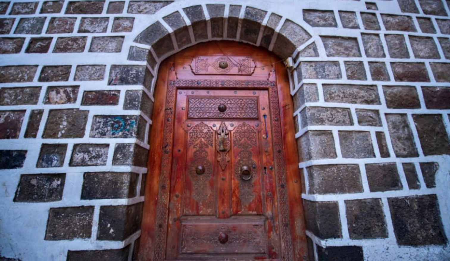
Old City Sana'a, March 8, 2020

operations and cement constructions, along with 15 instances of digging in search of treasure. [48]