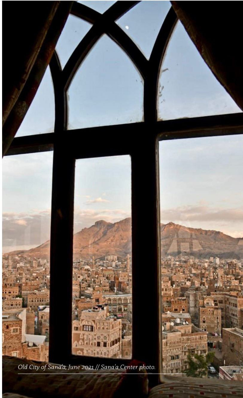
Old City of Sana'a, June 2021

Coordination is lacking between governmental bodies in charge of restoration. These include the Ministry of Public Works and the Ministry of Endowments and Guidance, as well as the Amanat al-Asimah (Capital Municipality) district administration. This failure to coordinate can be dangerous. For instance, where building foundations have collapsed due to street washouts and repairing the latter is the job of the Amanat Al-Asimah public works office, restoration work has been limited to the building itself. Such an approach fails to protect against the wholesale collapse of the building. [53]