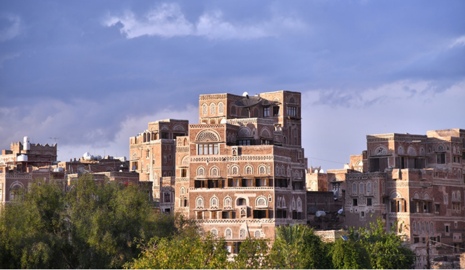
Old City of Sana'a, April 21, 2020 // Sana'a Center photo.

Souq al-Sabha, currently Al-Sabah, outside the western portion of the Old City wall. [19] Since that time, other neighborhoods have been built to the east and west.