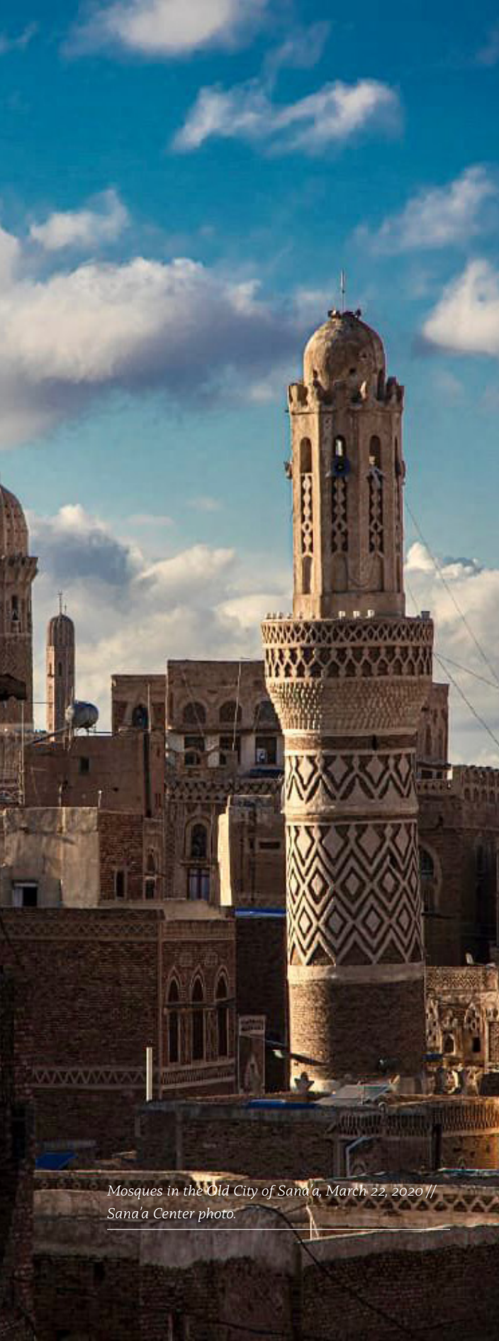
Mosques in the Old City of Sana'a, March 22, 2020 // Sana'a Center photo.

2011, given that the main water pressure has remained weak, citizens have dug into the roads to connect their own pipes to the water network to supply their homes with drinking water; this results in leakages, affecting house foundations and road surfaces. [36]